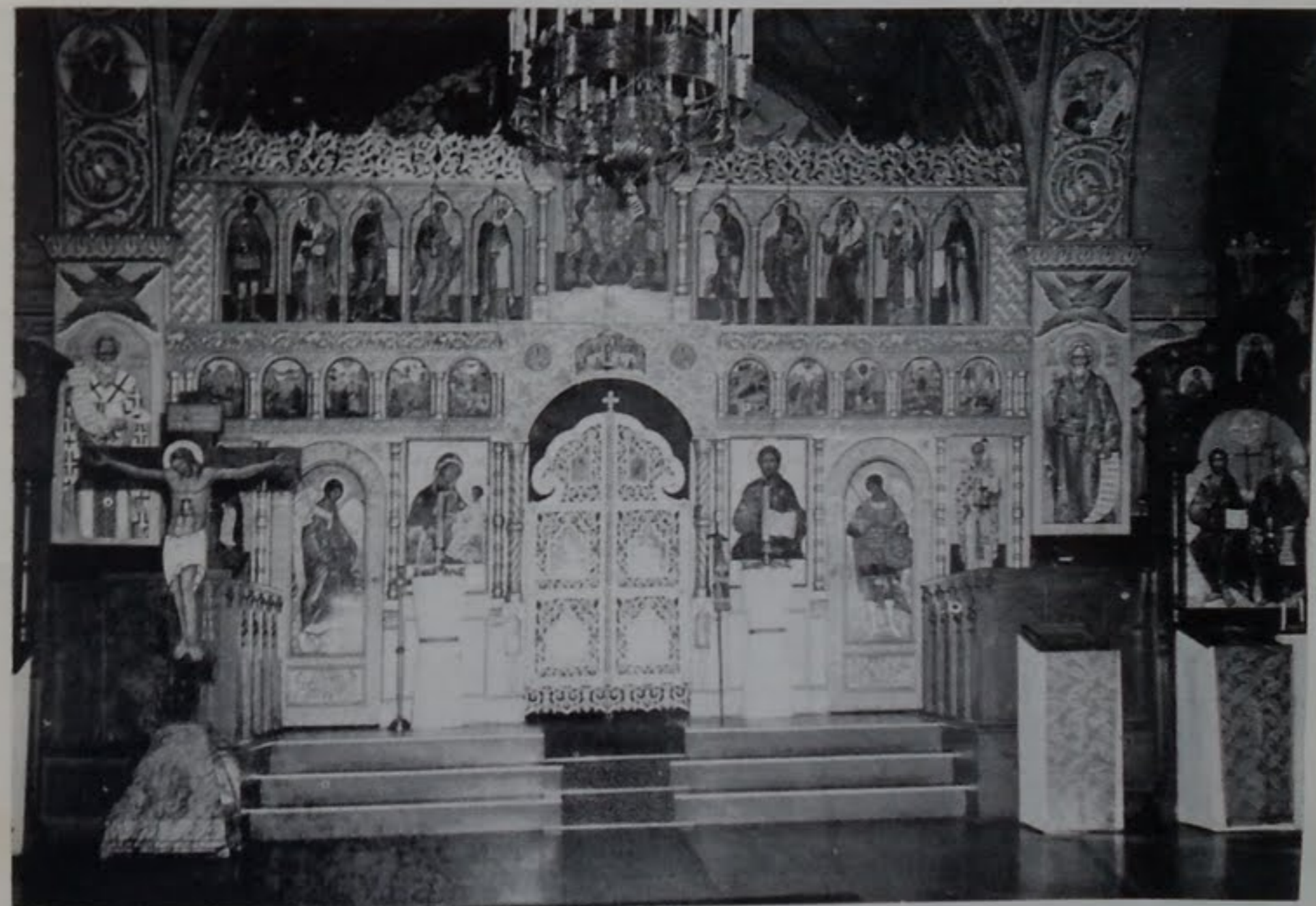
Icon-screen of the main church, hand-carved by the monks.

writer. A "reading on the Sublime" only extant.