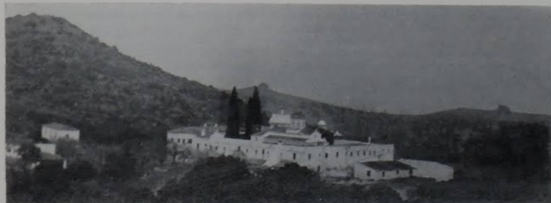
Aegina: The Convent of the Holy Trinity, established by St. Nectarios, as it appears today