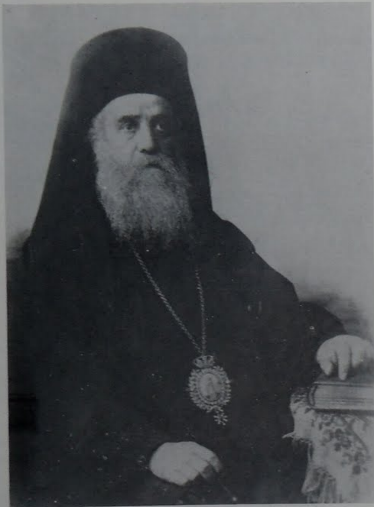
ST. NECTARIOS KEPHALAS