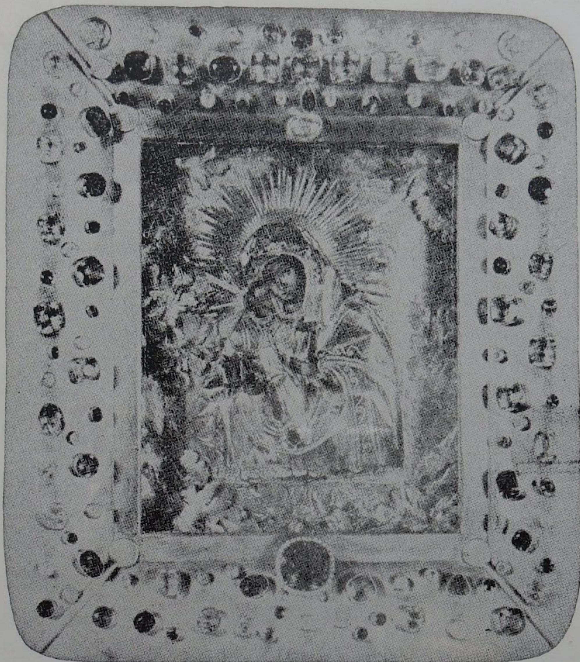
THE RENEWED MIRACLEWORKING VLADIMIR MOTHER OF GOD

A T THE DAWN of Christianity God, through His true servants, worked great, almost incredible miracles whereby the Faith has grown and increased in strength throughout the whole of the Christian era. So also before the end of the world God will show the world great miracles to aid the faithful and so that the wavering may freely choose eternal blessedness or damnation. Very likely as an indication of the beginning of the end, great miracles have taken place in this century. In Russia, for example, after the fall of the Orthodox Monarchy, an astonishing number of icons were miraculously renewed -- and not only icons, but also crucifixes, whole frescoed walls of churches, even huge church domes. In the twenties this wave of miraculous renewal spread to Manchuria, where the miracle has been repeated many times right up to the present time. Abundantly was the grace of God