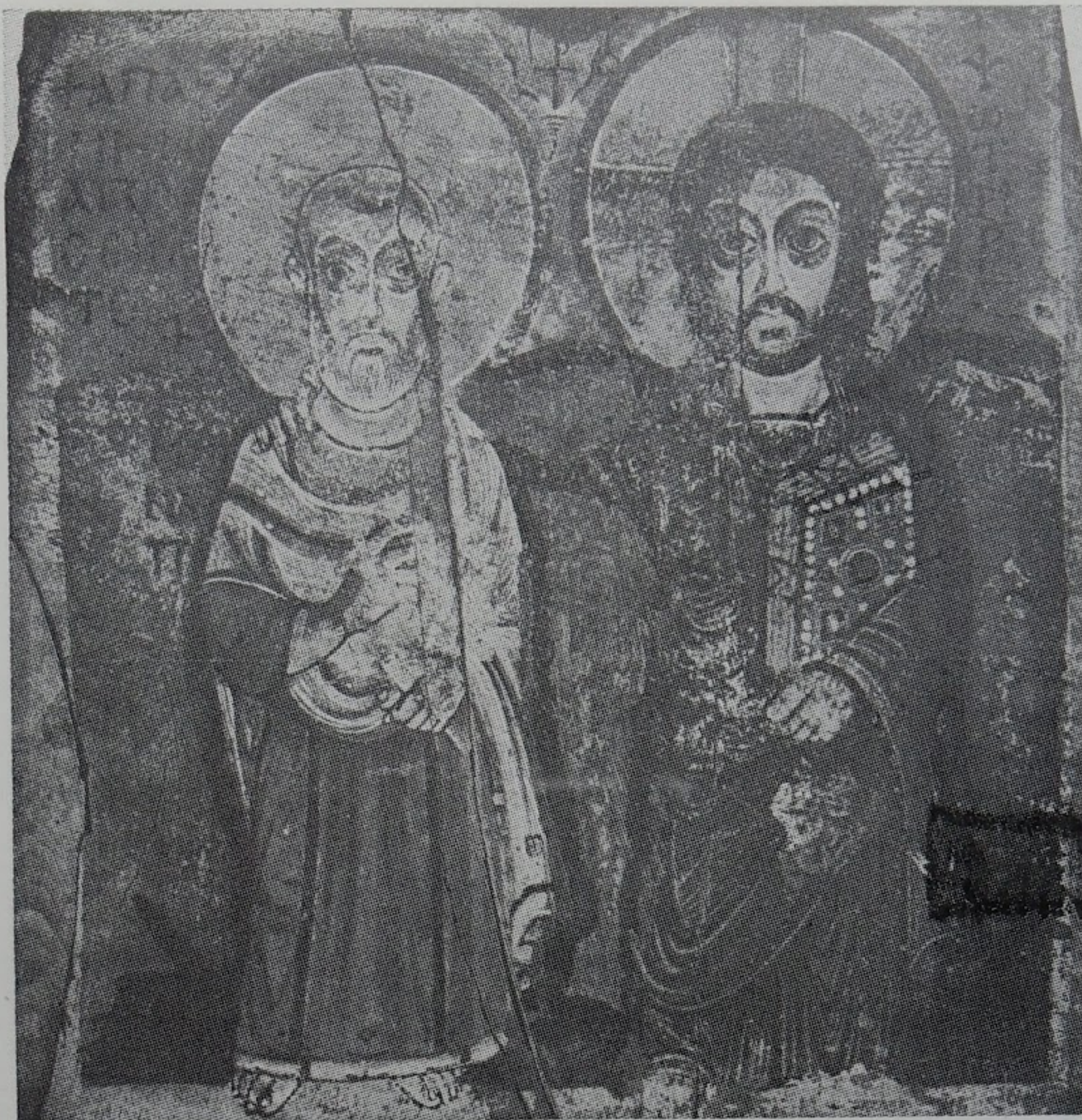
SAINT MENAS STANDING WITH THE SAVIOUR

A 6th-century icon from St. Catherine's Monastery on Mt. Sinai