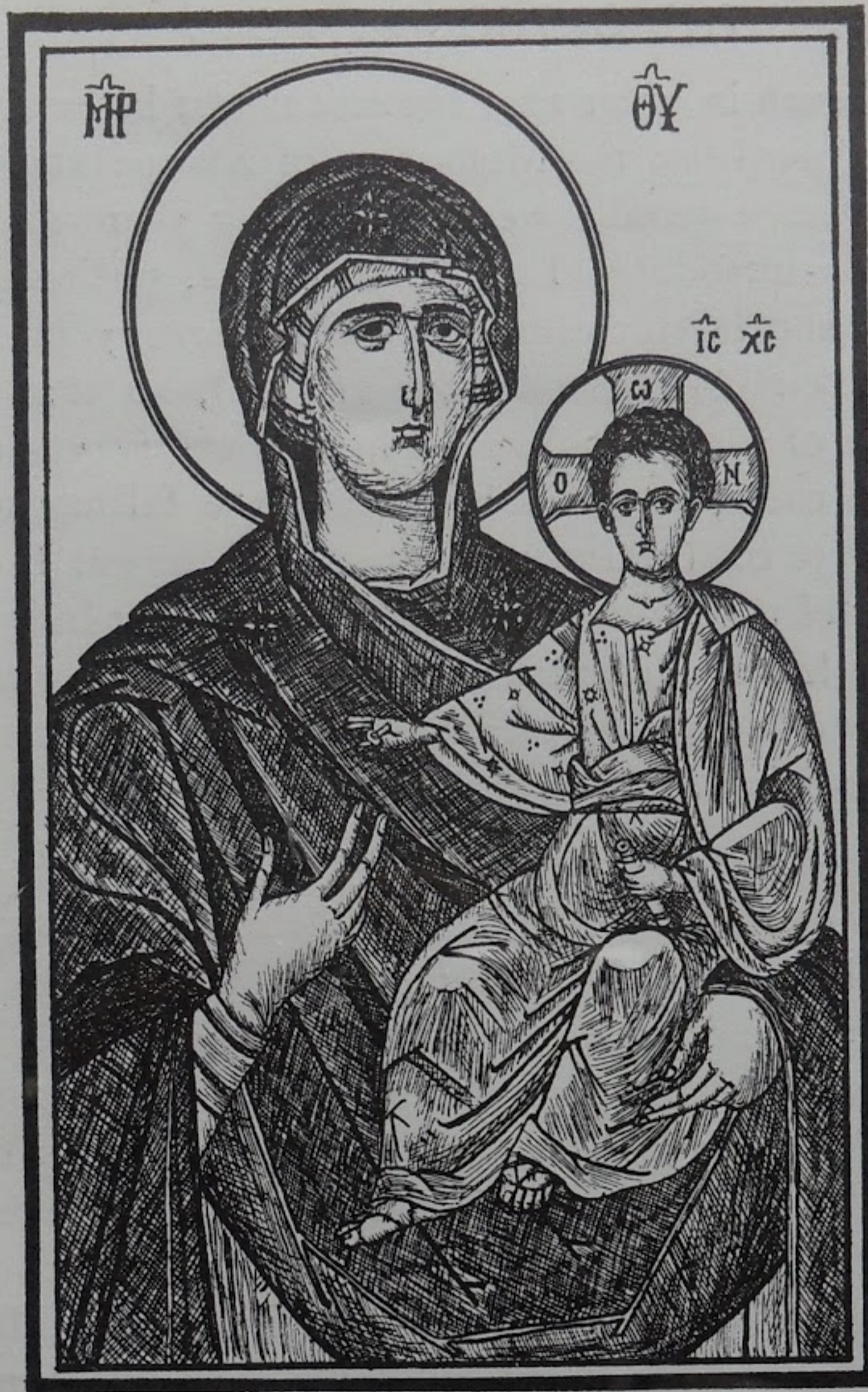
THE ZOGRAPHOU MOTHER OF GOD "OF THE AKATHIST" Commemorated with the Zographou Martyrs on October 10

persuaded by violence and money, or with fear of tortures and death, and became deniers of the Orthodoxy of their and of our Fathers. But the majority of them sealed their confession with their own blood, and by their steadfastness censured the Pope for his sacrilegious assuming of the title "Vicar of Christ," Who Himself alone was, is, and shall be the Head of His holy Church. Unfortunately, however, the unfortunate Lavra and the Monastery of Xeropotamou fell and turned away from the teachings of our Fathers and received the Westerners with honor and with servile fear. This took place, certainly, because the Emperor co-operated with the Latins to turn aside the monks of the Holy Mountain to the false doctrines of Rome.