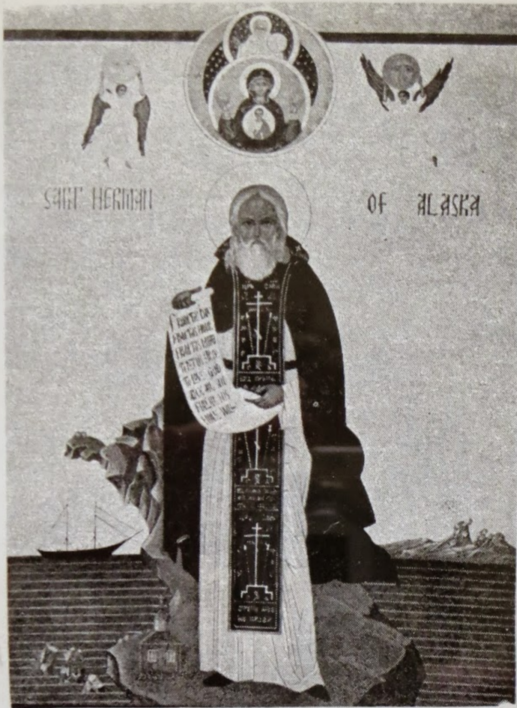
SAINT HERMAN, SCANDINAVIAN ICON

wild and little-accessible Spruce Island, surrounded by the constantly raging ocean, the path of people to it has not been overgrown. Although it is difficult to get to his grave because of the craggy, surf-drenched shores and the want of a suitable bay, nonetheless the infirm have been drawn to his grave in expectation of blessed help by his intercession in prayer before the Throne of God, in various sufferings, in grief and need, in sorrows and afflictions. And their labors and hopes have not been in vain.