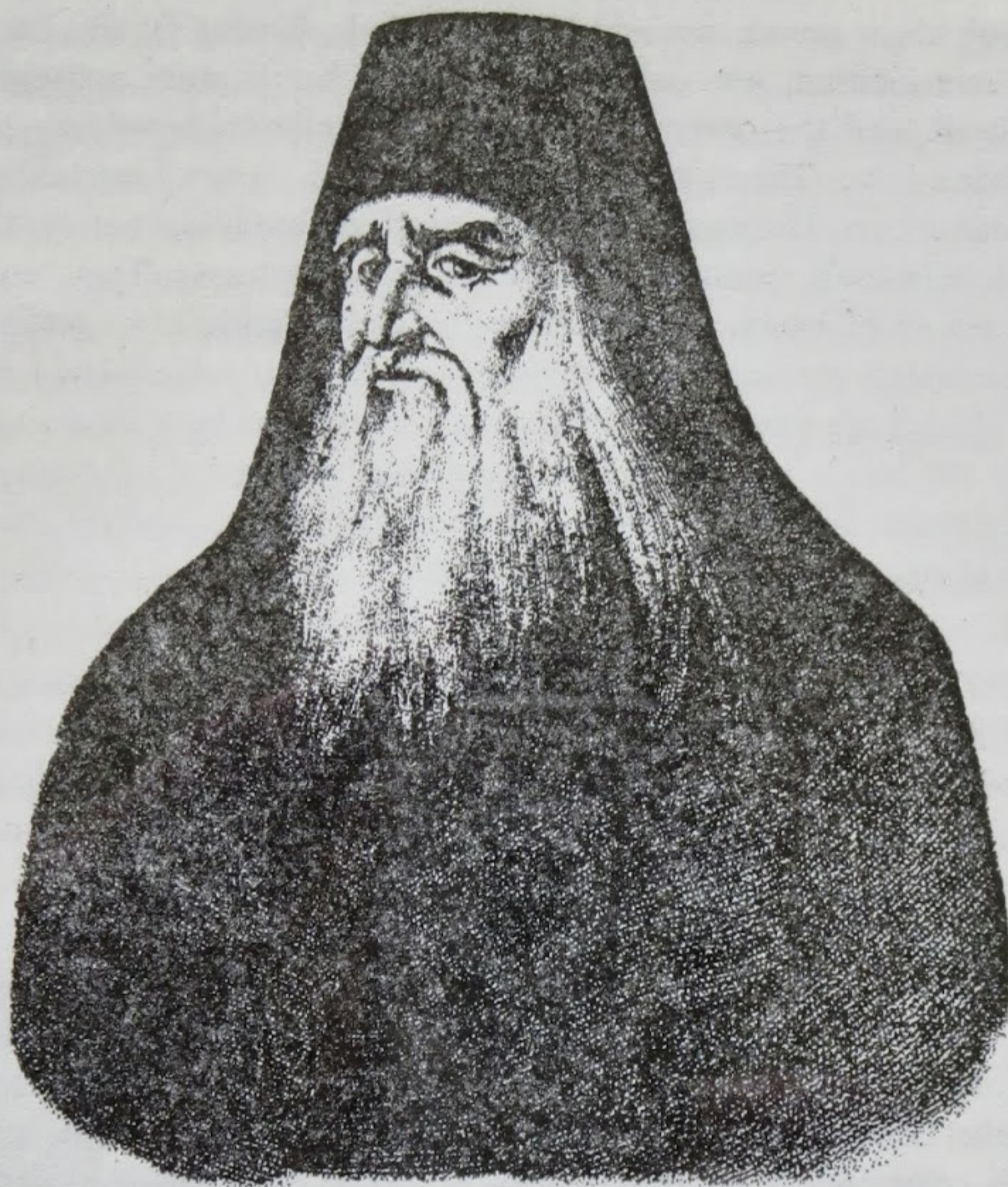
BLESSED NAZARIUS, ABBOT OF VALAAM