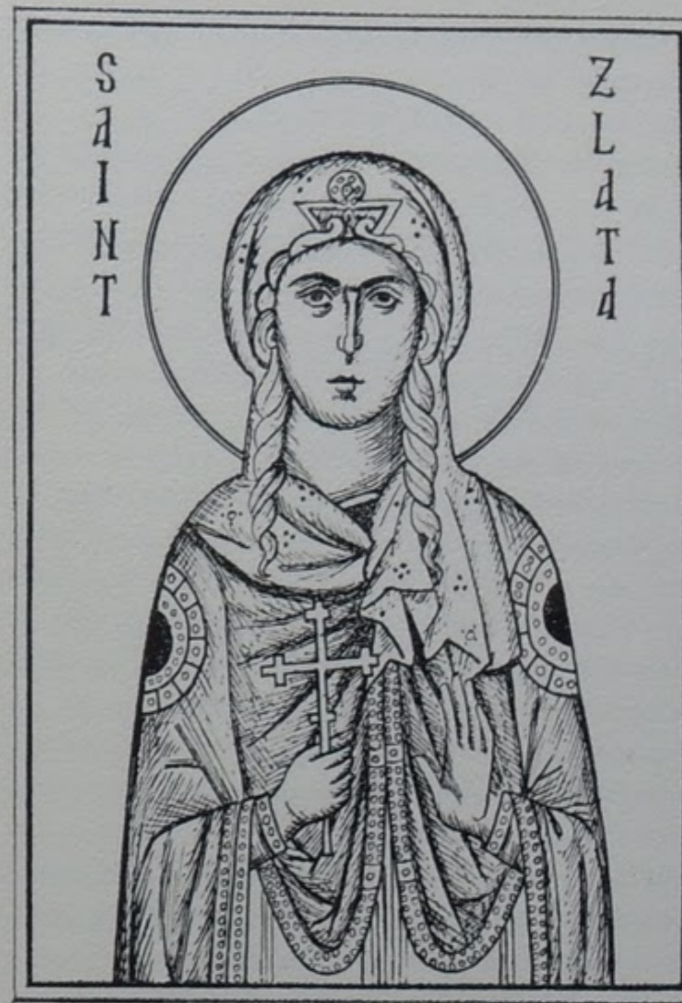
THE HOLY NEW-MARTYR ZLATA Commemorated on October 13