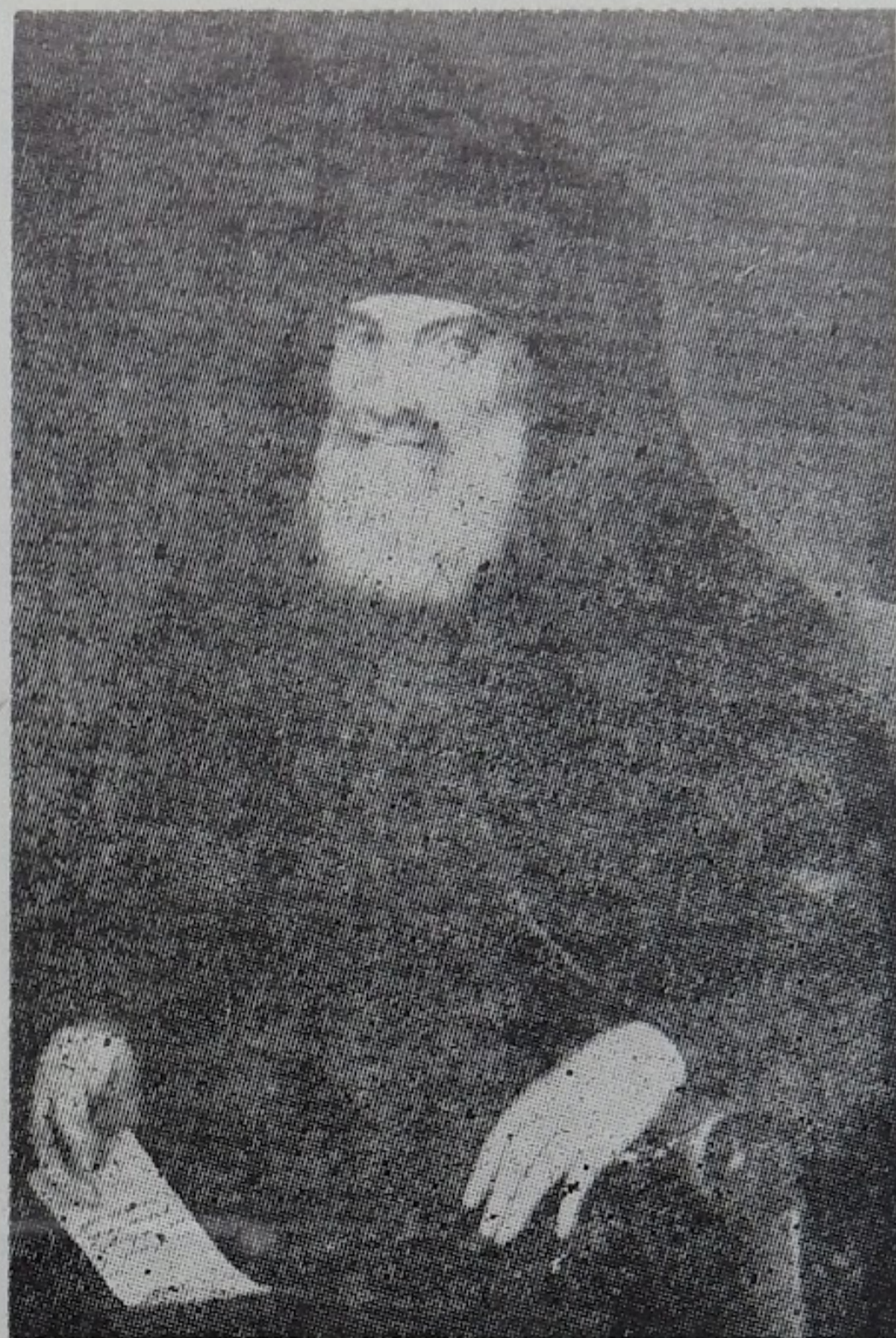
St. Callinicus in the evening of his life