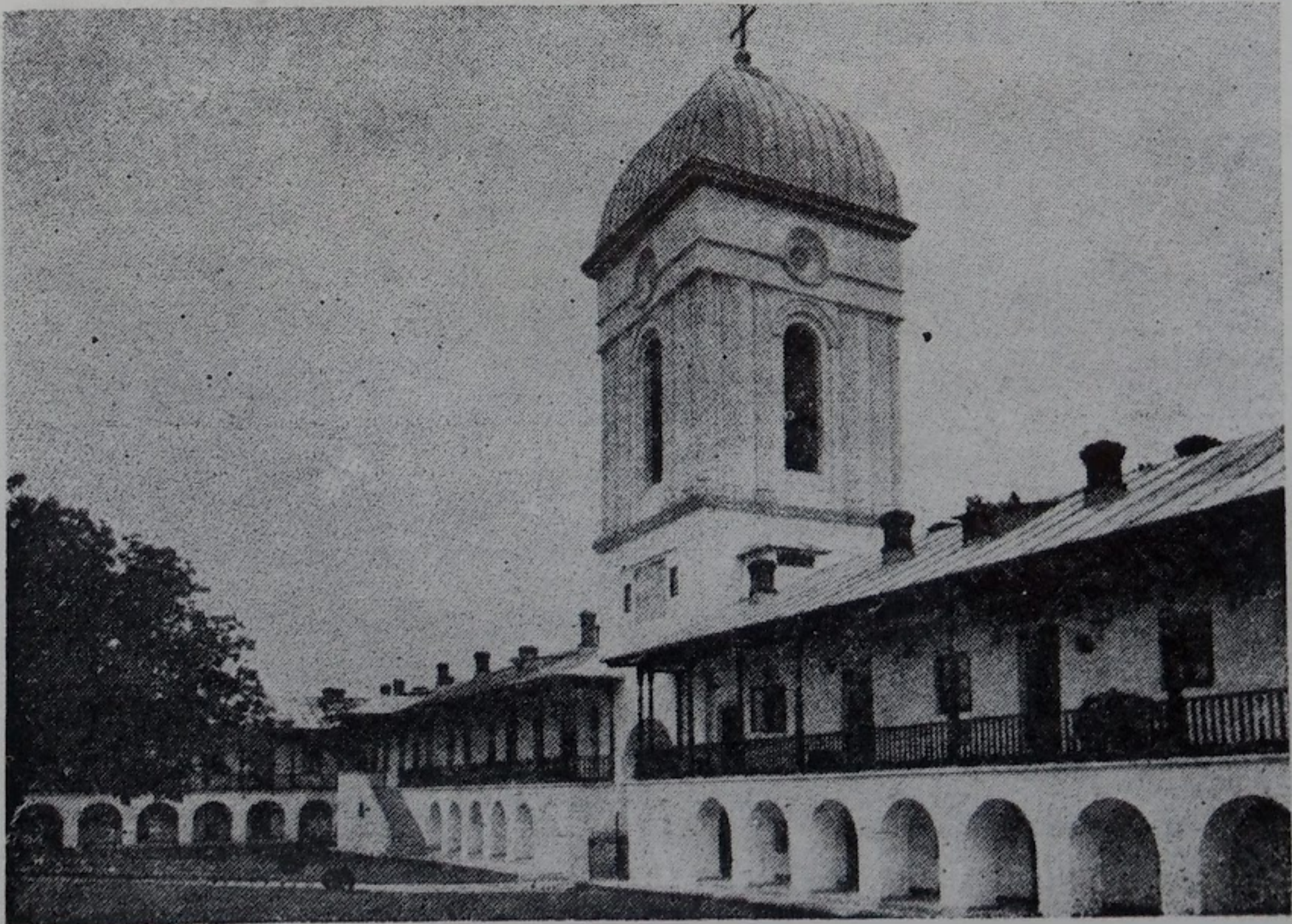
Cernica Monastery tower gate and cells