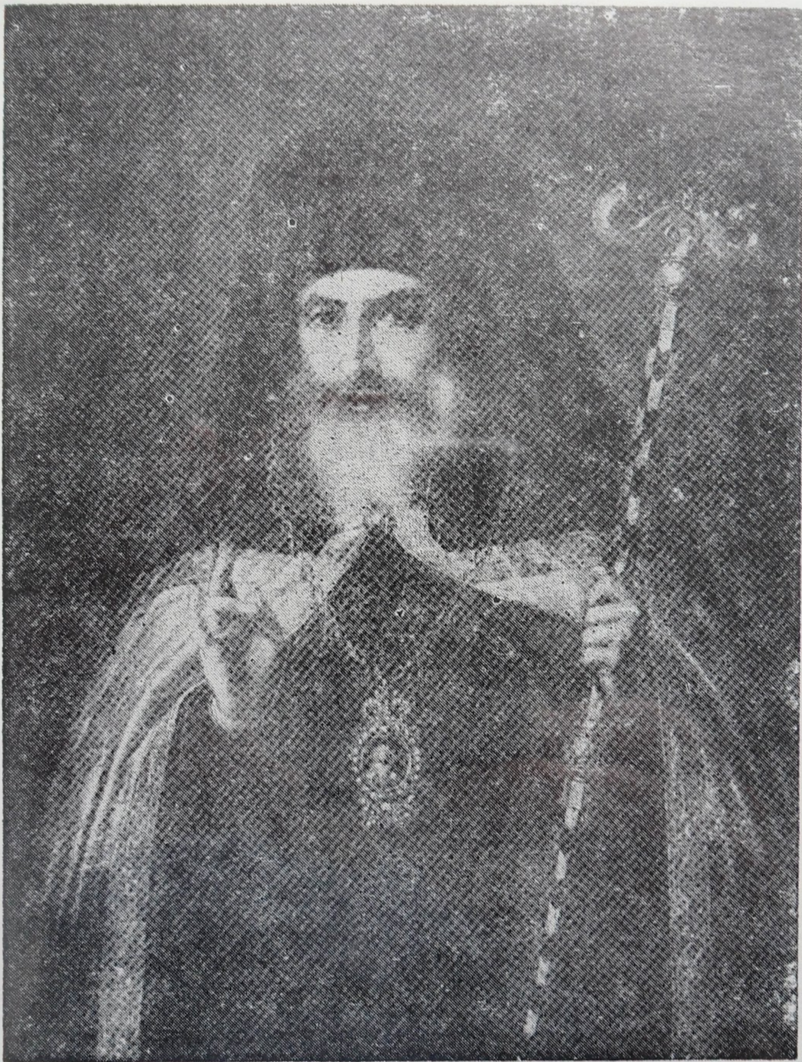
SAINT CALLINICUS A portrait from life