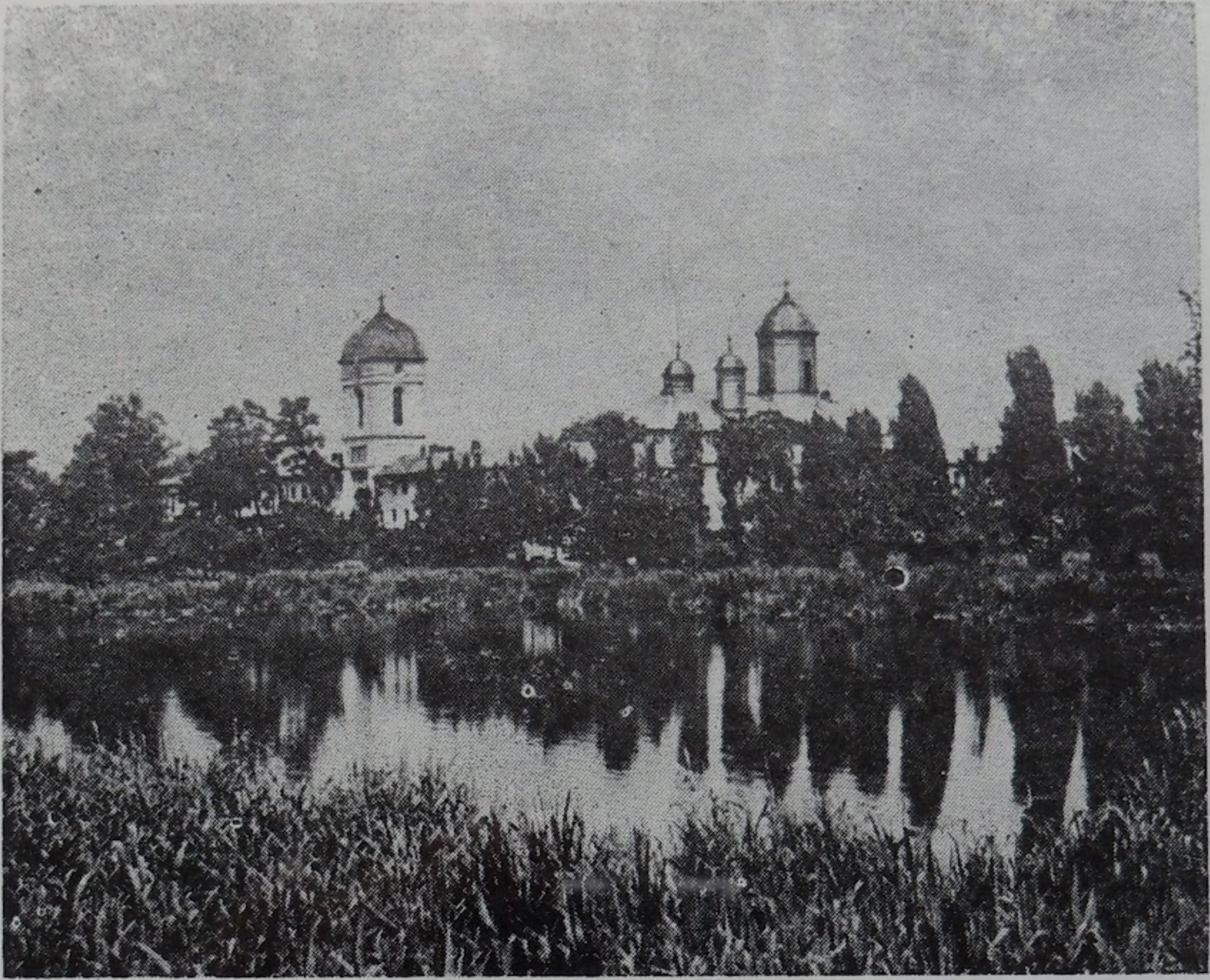
The Cernica Island Monastery A general view over the waters