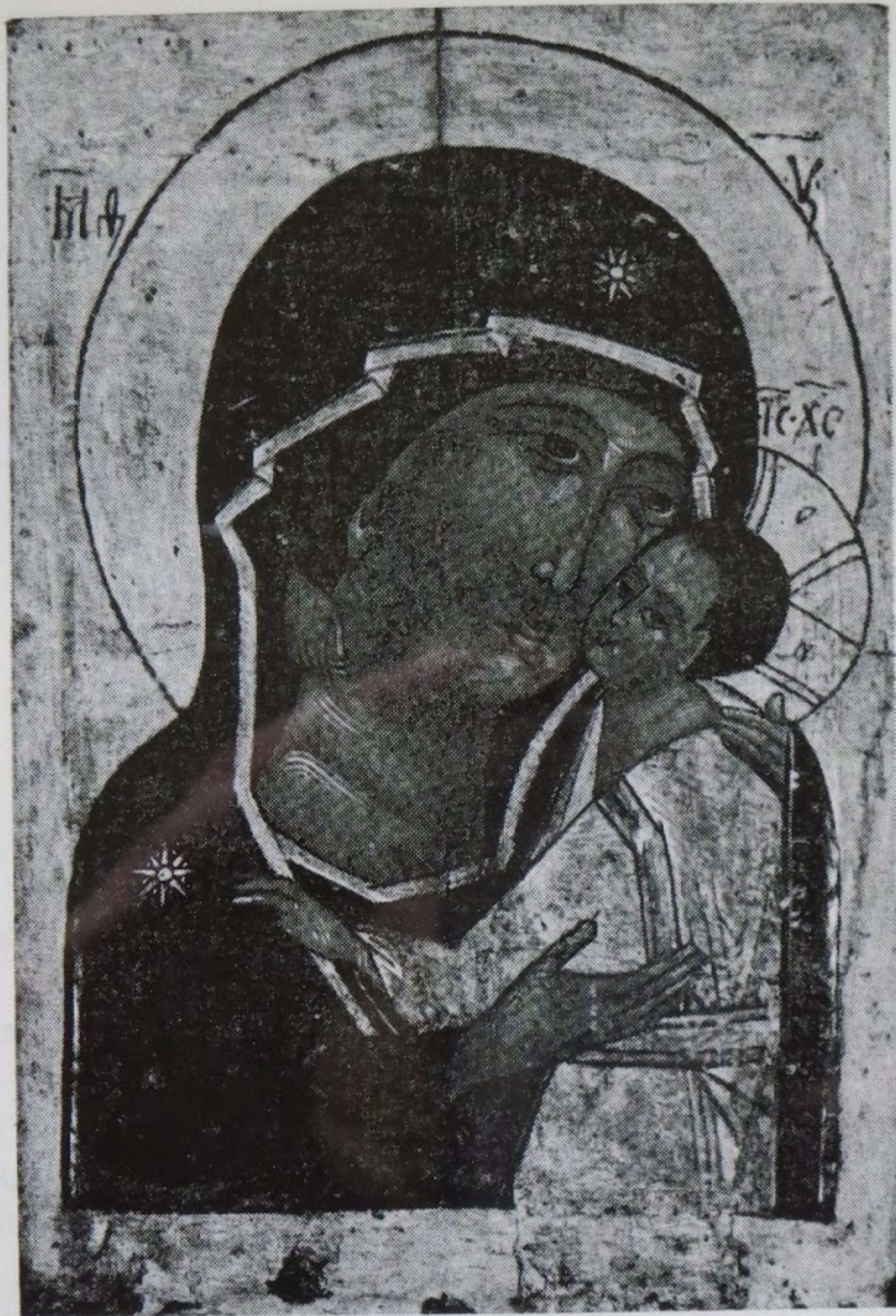
THE 'UMILENIYE' ICON OF NOVGOROD Commemorated on July 8

The following account, translated from the standard pre-Revolutionary book by E. Poselyanin on the Icons of the Mother of God, is the 16th in a continuing series of the historical Weeping Icons of the Mother of God.