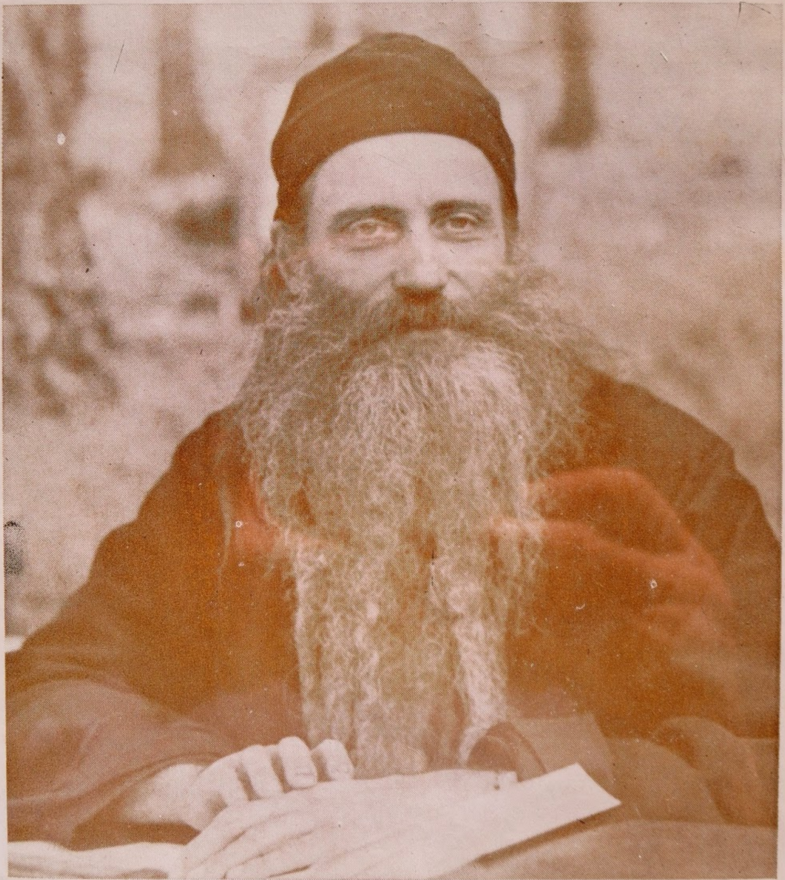
Hieromonk Seraphim Rose, instructing at the New Valaam Theological Academy.