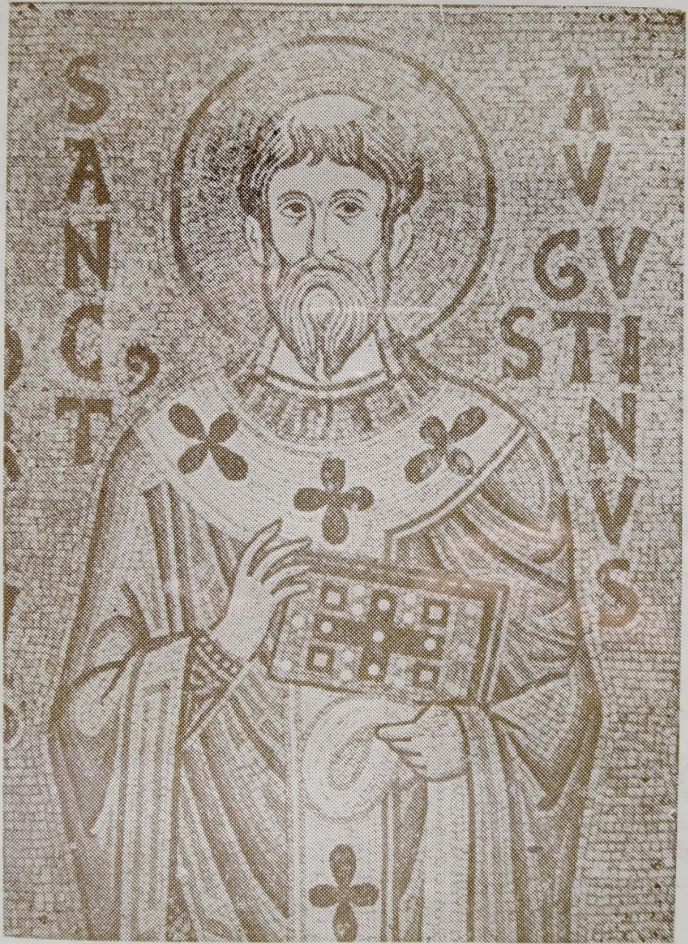
A mosaic fresco of St. Augustine, in the Cefalu Cathedral in Sicily.