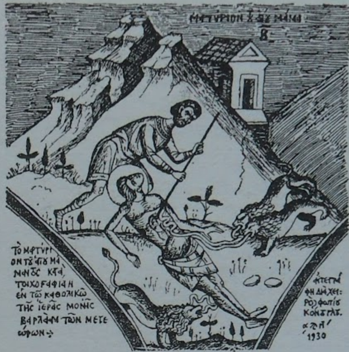
THE MARTYRDOM OF ST. MAMAS Sketch by Kontoglou of a fresco in the monastery of Barlaam, Meteora

that had accompanied him from the wilderness. The lion spoke to the blessed Mamas with a human voice — for manifesting His almighty power, God opened the mouth of the beast as once He opened the mouth of Barlaam's ass — "Thou art my shepherd who tended me on the mountain!" Having uttered this, he leaped upon the crowd, for there was present a numberless multitude of both pagans and Jews, adults and children. By God's will the gates of the arena locked themselves, and the lion mangled a great number of people, so much so that even the governor barely escaped death, and only a few others were able to flee the wrath of the beast which seized and tore all to pieces.