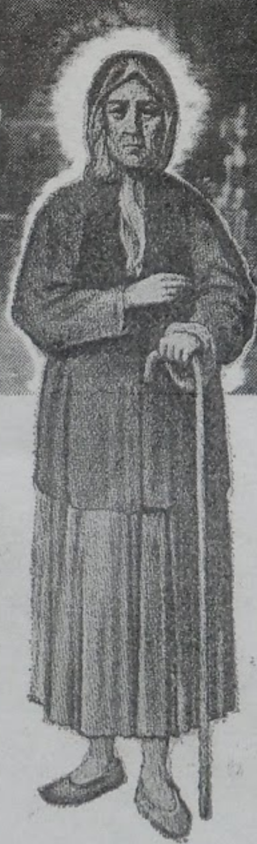
Blessed XENIA of Petersburg