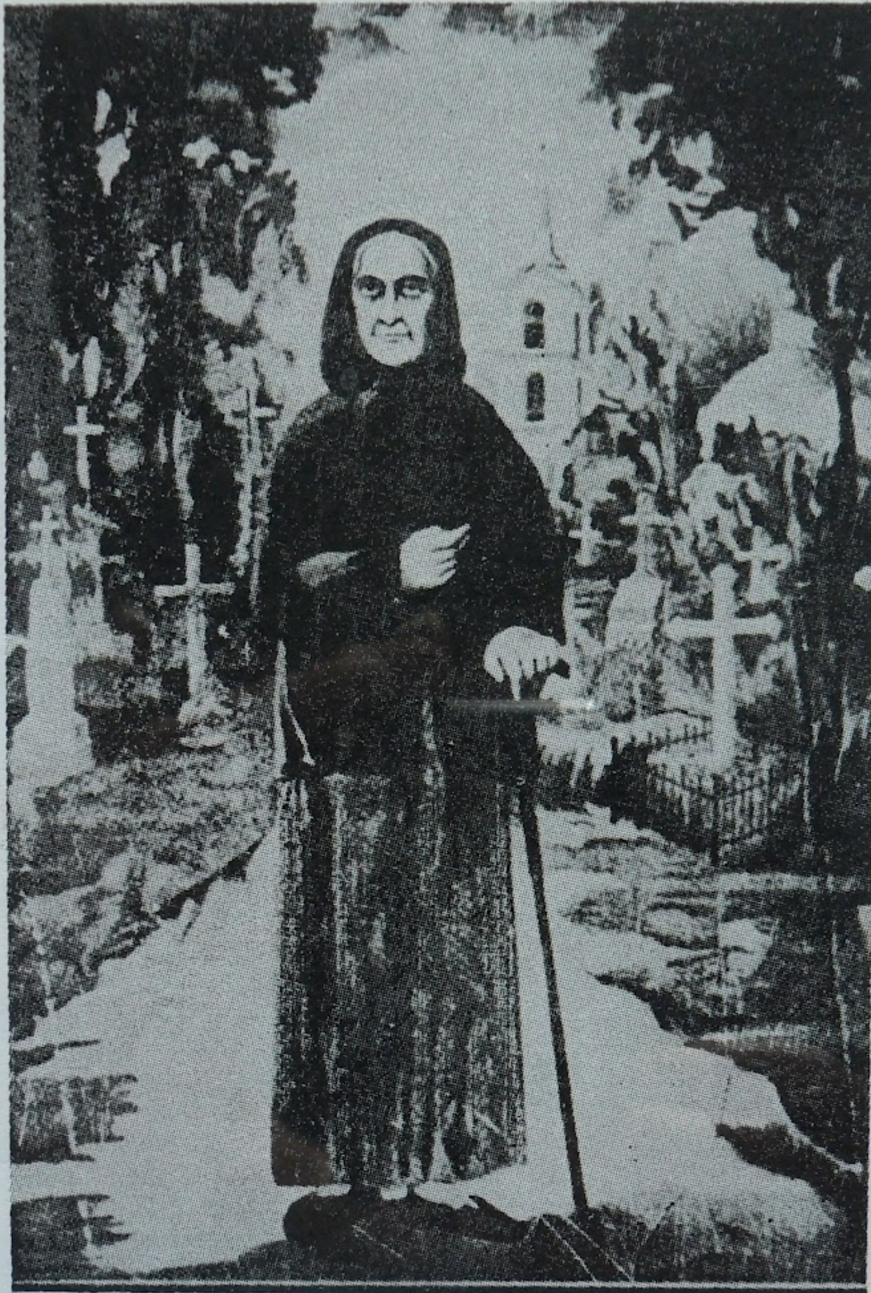
The earliest known representation of BLESSED XENIA OF PETERSBURG