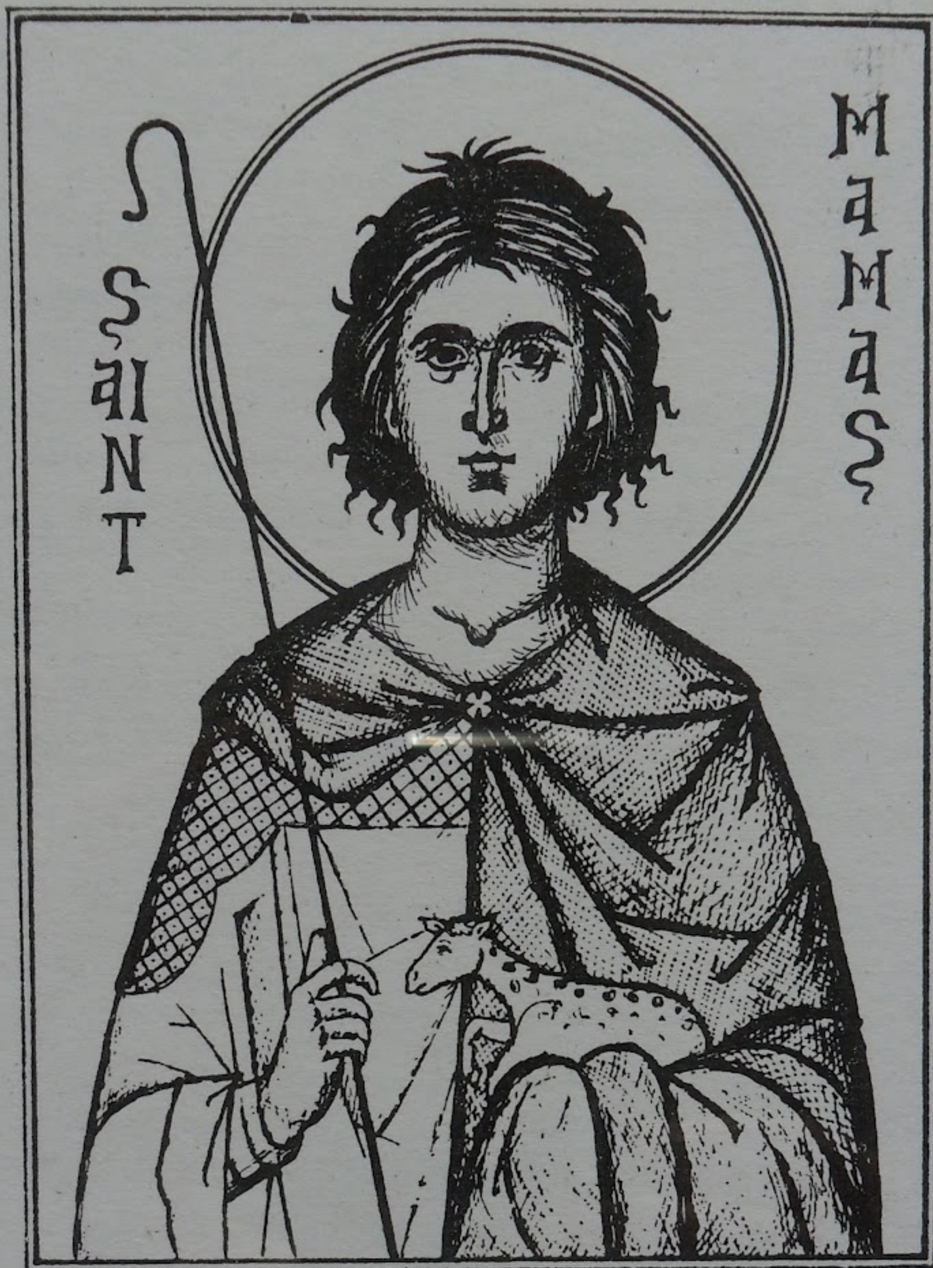
THE HOLY GREAT MARTYR MAMAS Commemorated September 2