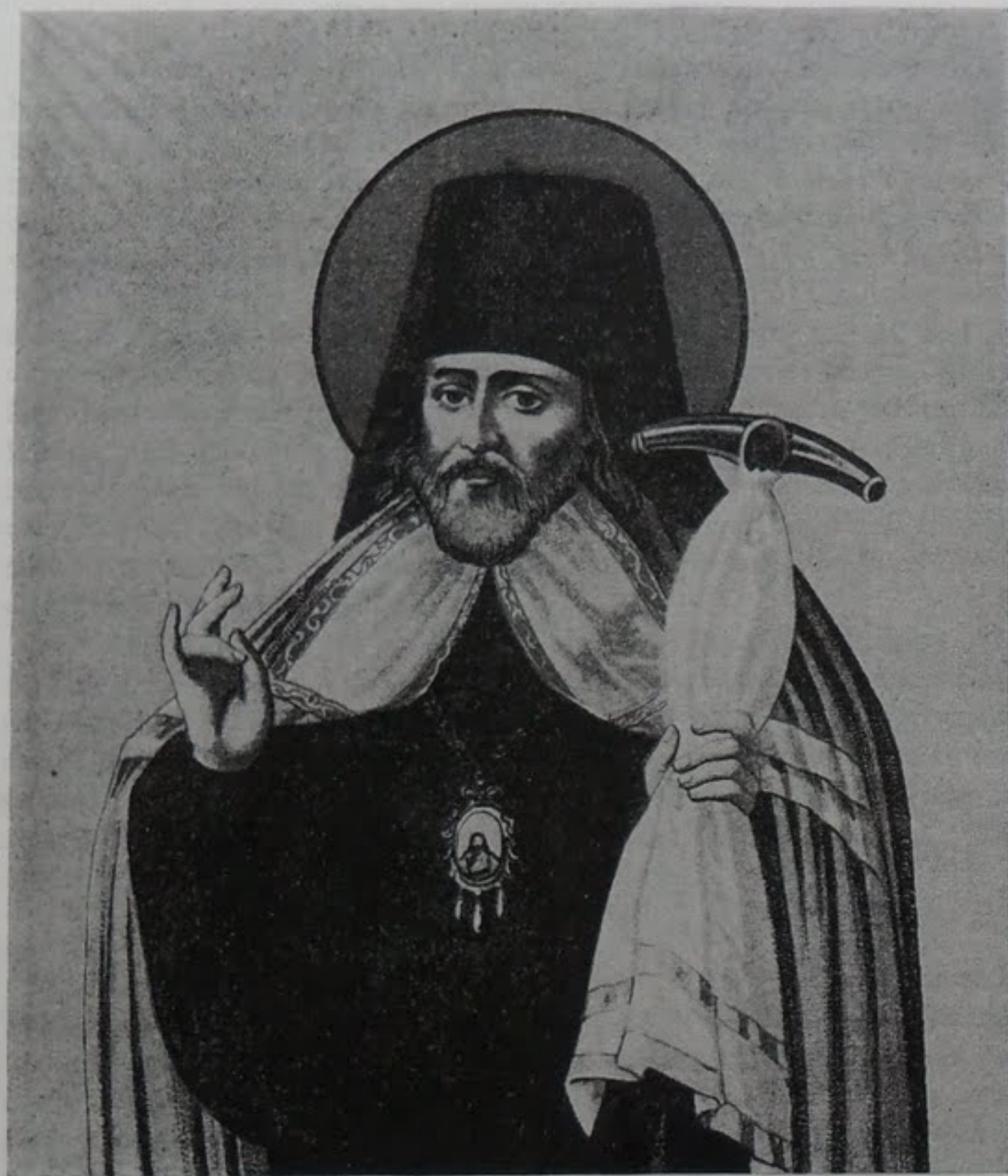
ST. INNOCENT OF IRKUTSK