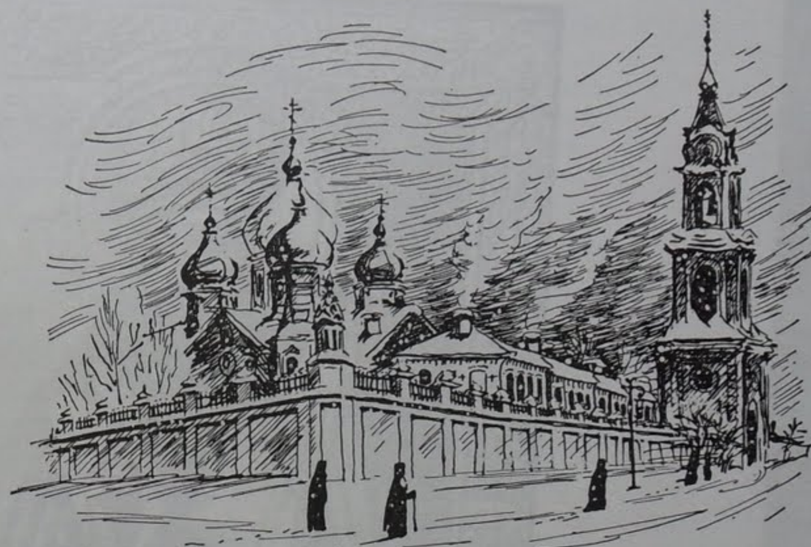
The Ascension Monastery in Irkutsk

His constant labors, the severe Siberian climate, his long journeys, and sorrow and affliction broke down the already frail health of St. Innocent. He fell ill and in the autumn of 1731 lay in bed, unable to celebrate the services. In the morning of November 27, 1731, he peacefully departed to the Lord, being about fifty years of age. Amid the weeping of his flock, the body of the Saint was buried in the church of the Tichvin Icon of the Mother of God in the Ascension Monastery.