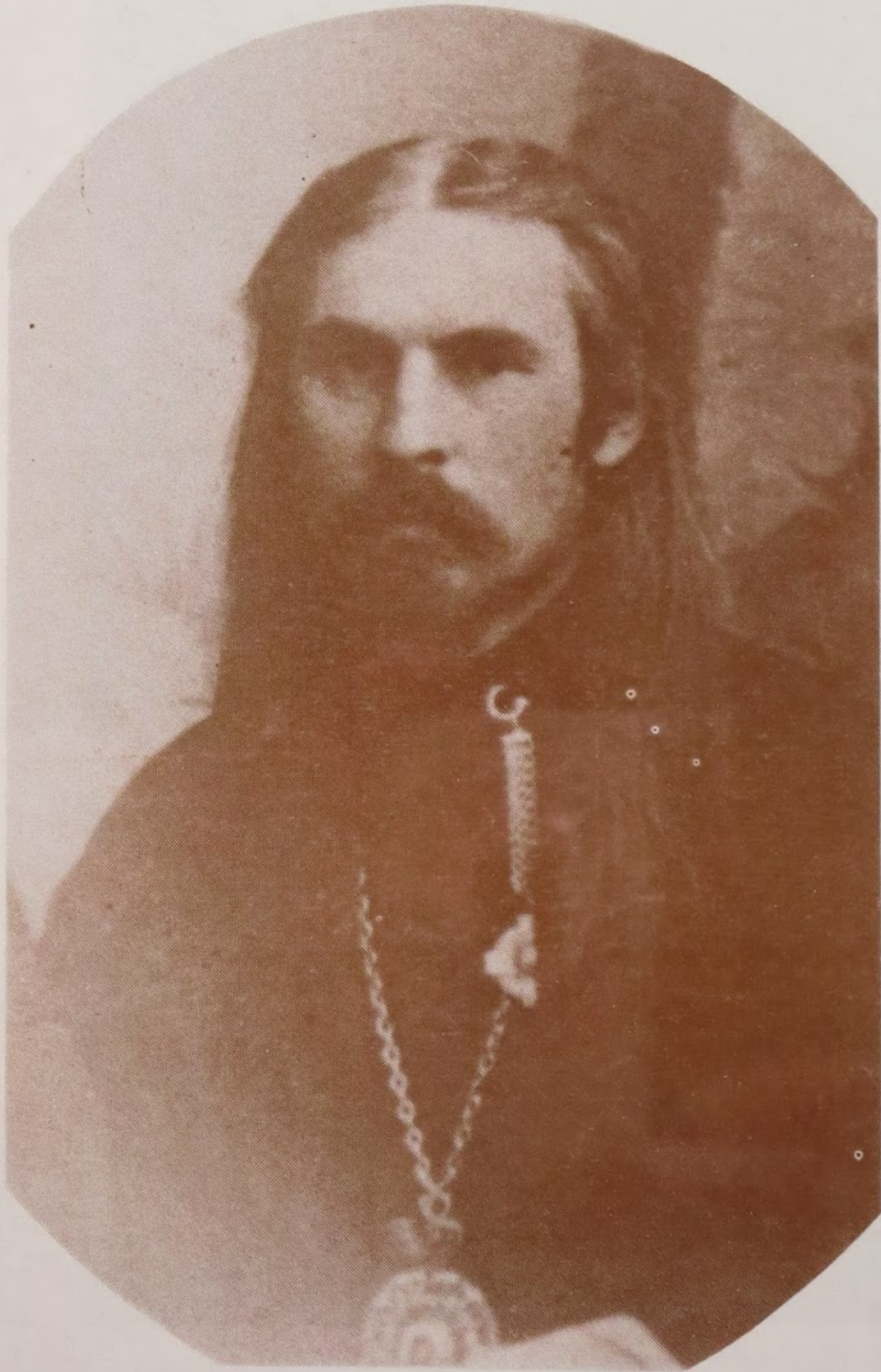
BISHOP ONOUPHRY IN THE 1930'S