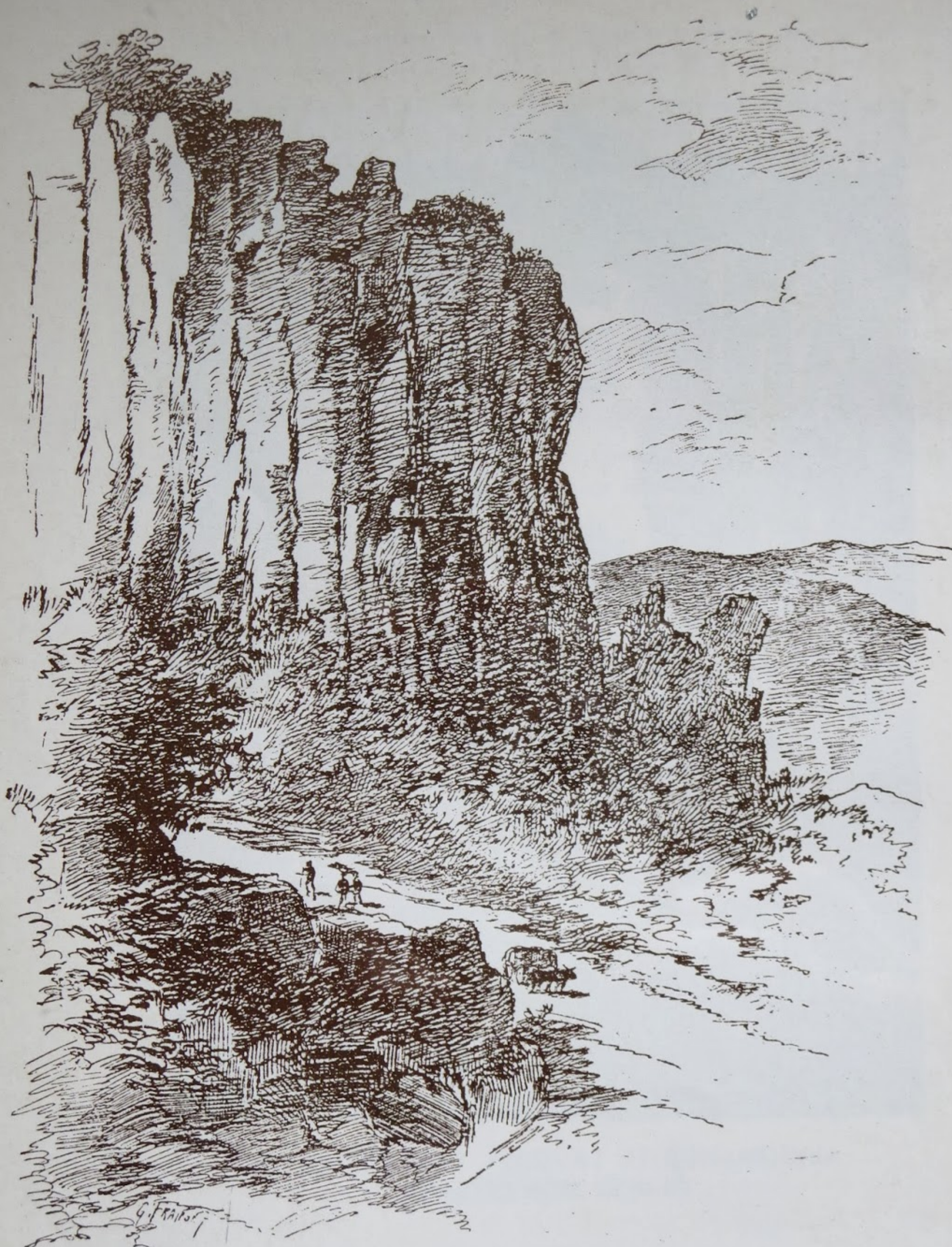
A CLIFF OF THE AUVERGNE (ORGUES de BORT) SIMILAR TO THE ONE ON WHICH ST. CALUPPAN STRUGGLED.