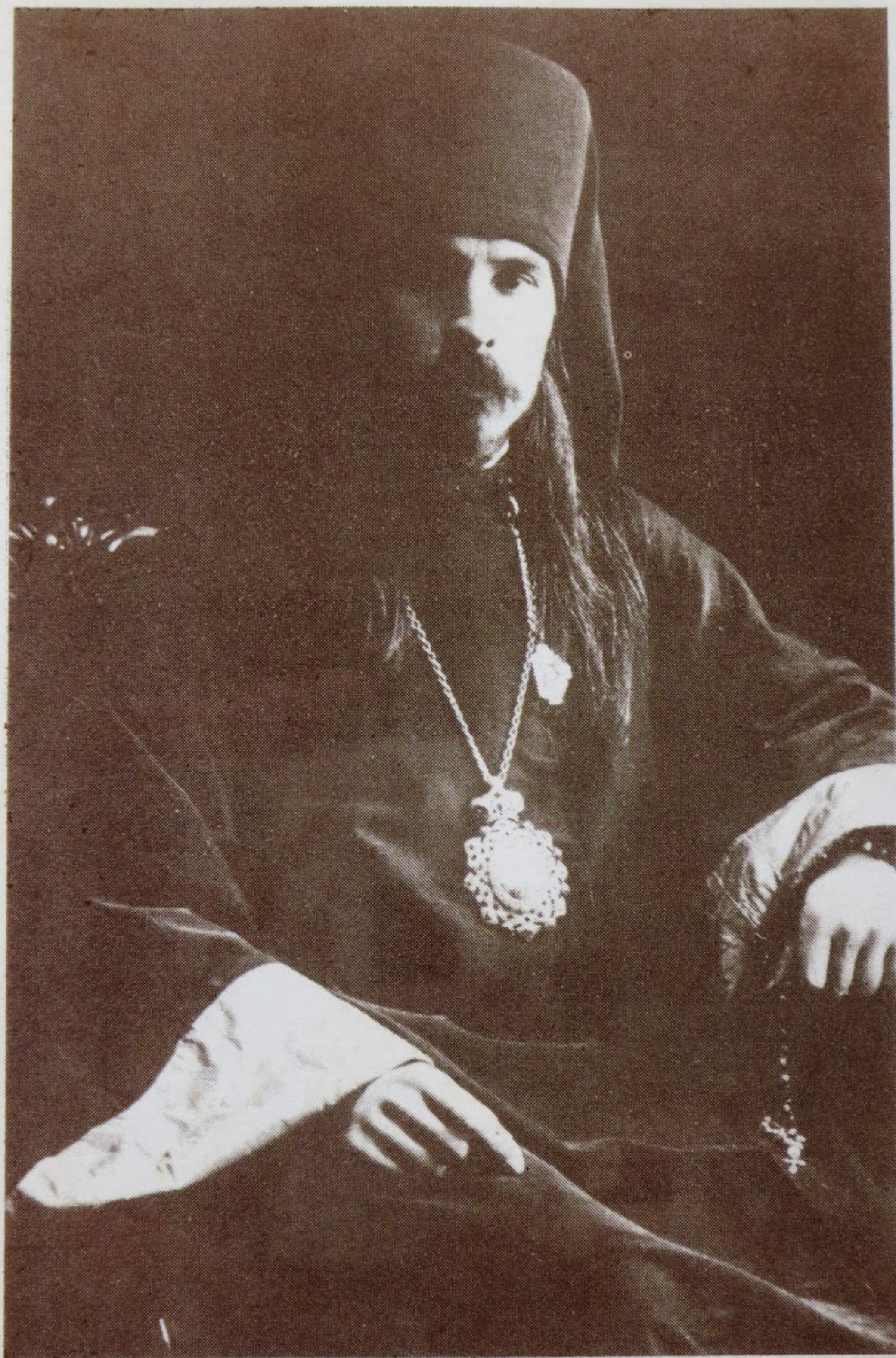
BISHOP ONOUPHRY IN 1924