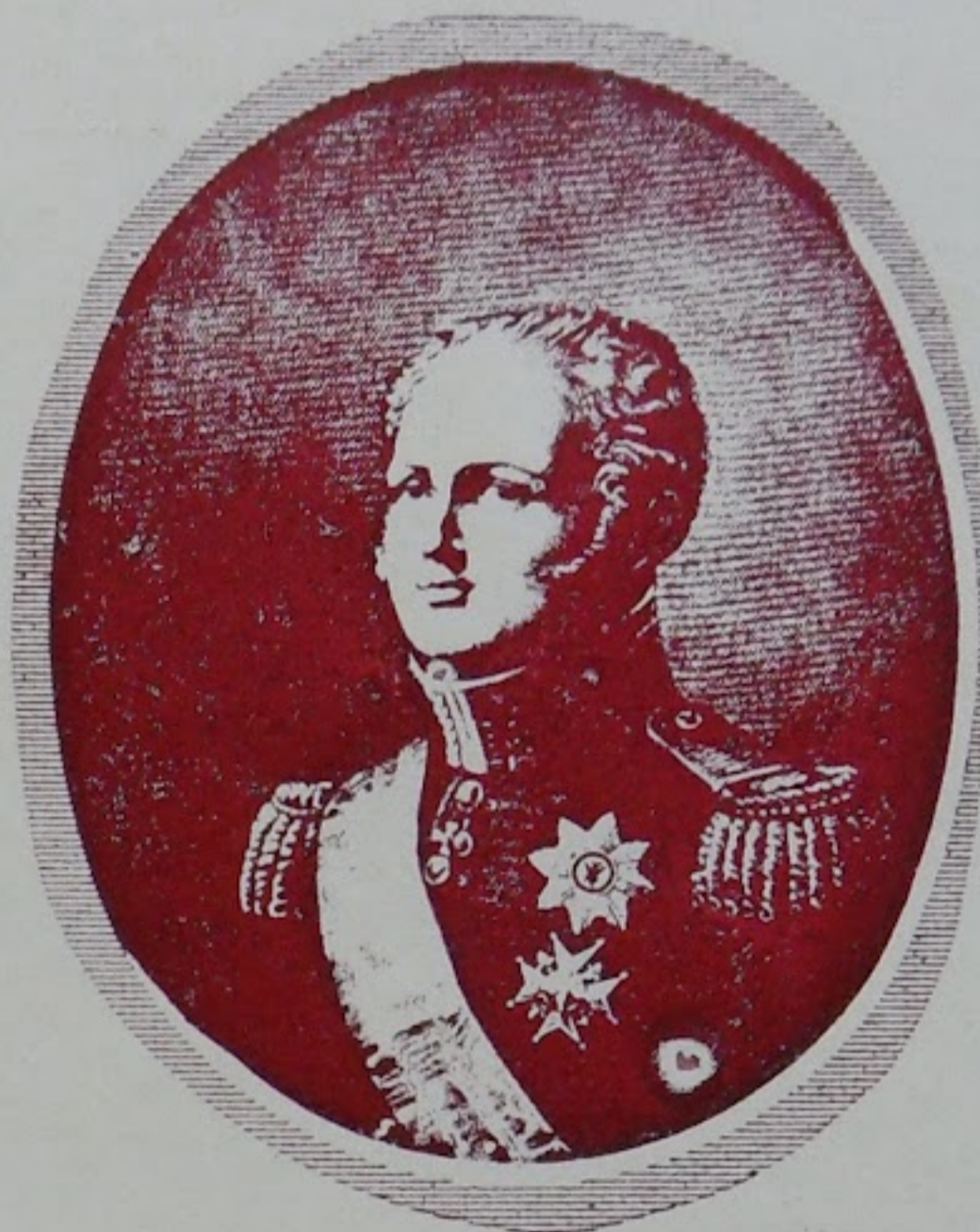
Tsar Alexander I