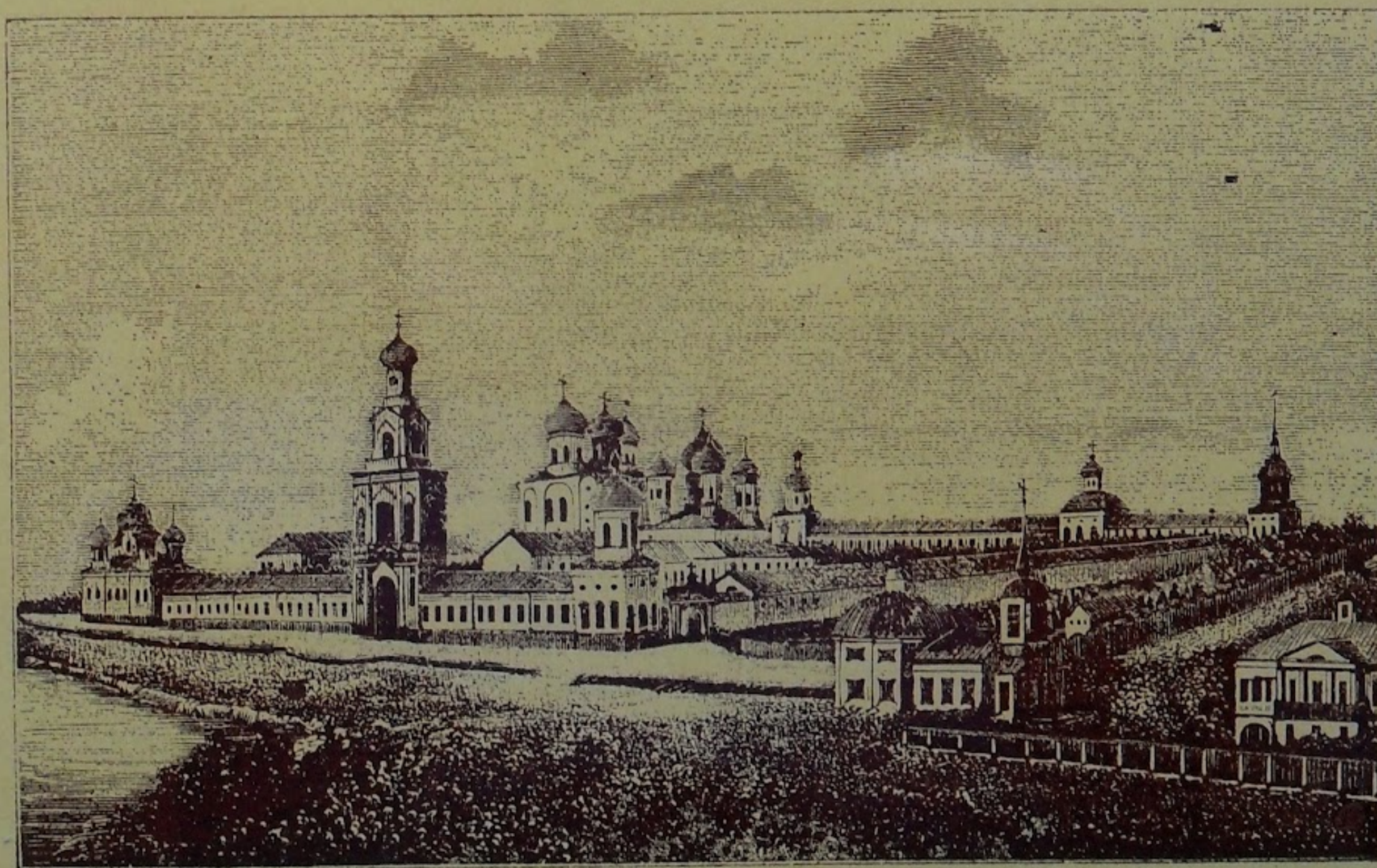
General View of Yuriev Monastery