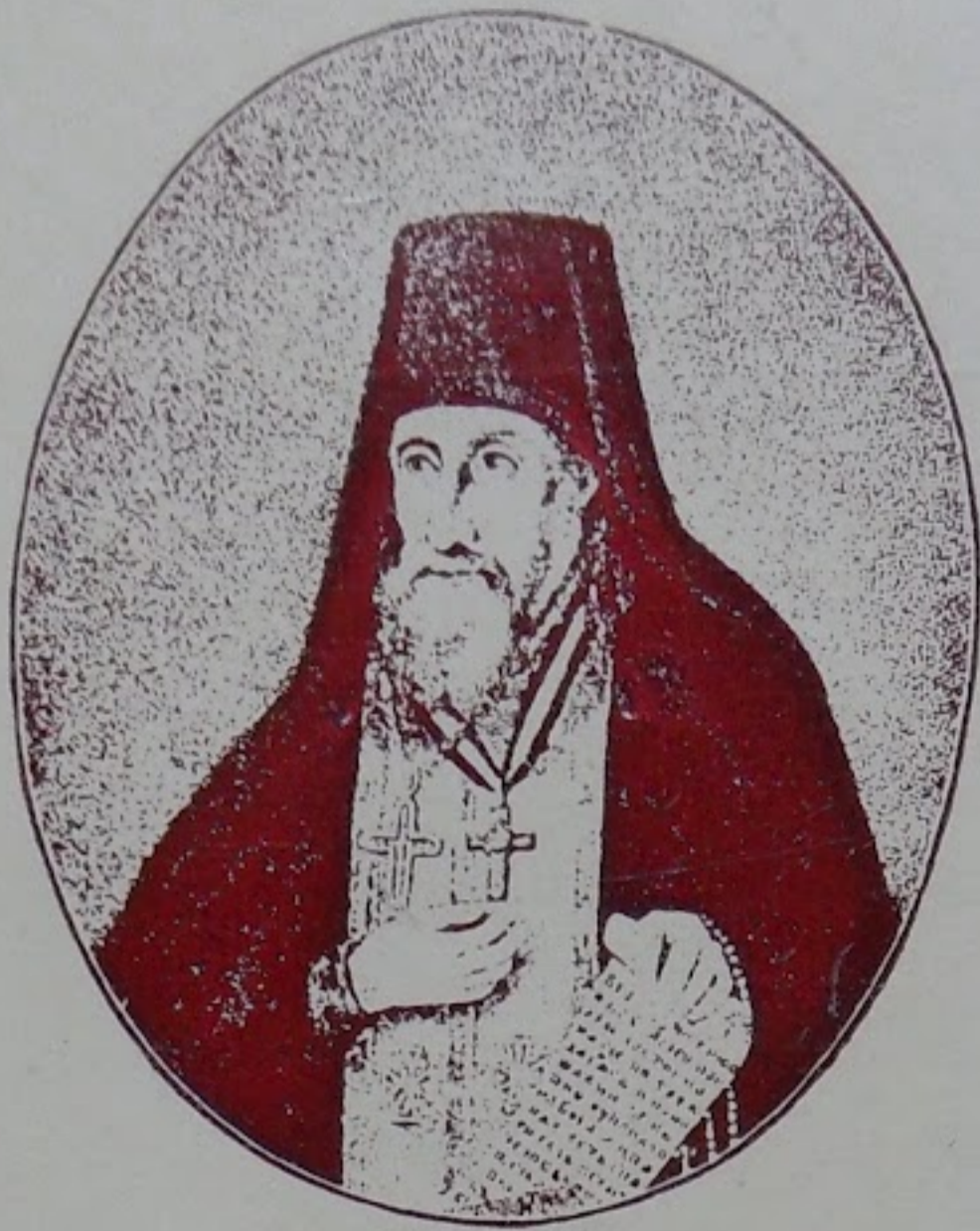
Elder Amphilocius of Rostov