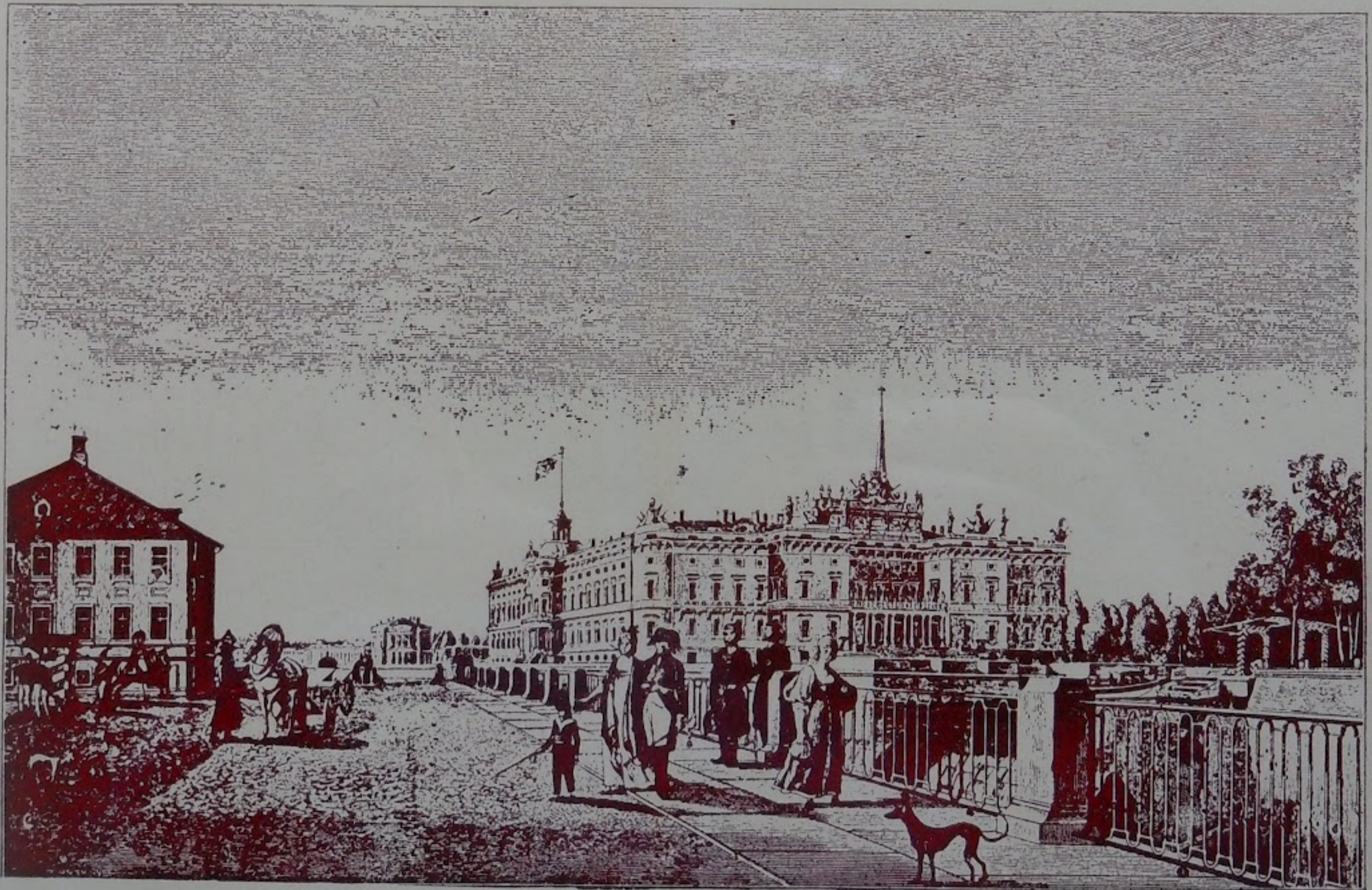
Mikhailovsky Palace in Petersburg