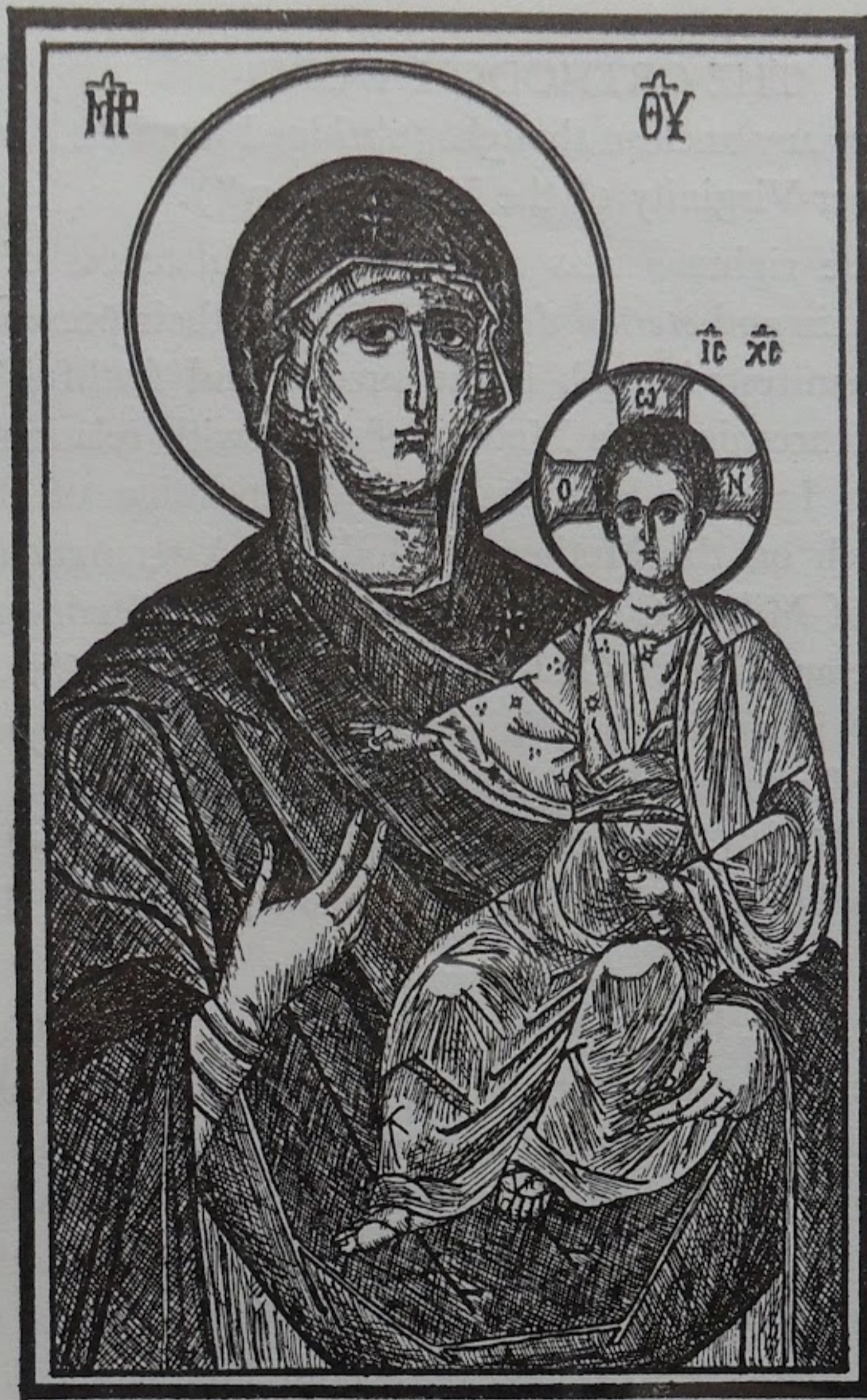
The Zographou Icon OF THE AKATHIST

years old, her parents, fulfilling their promise, solemnly led the little Mary to the Temple of Jerusalem; She Herself ascended the high steps and, by revelation from God, She was led in to the very Holy of Holies, by the High Priest who met Her, taking with Her the grace of God which rested upon Her into the Temple which until then had been without grace. (See the Kontakion of the Entry into the Temple. This was the newly-built Temple into which the glory of God had not descended as it had upon the Ark or upon the Temple of Solomon.) She was settled in the quarters for virgins which existed in the Temple, but She spent so much time in prayer in the Holy of Holies that one might say that She lived in it. (Service to the Entry, second stitcheron on "Lord, I have cried," and the "Glory, Both Now . . .") Being adorned with all virtues, She manifested an example of extraordinarily pure life. Being submissive and obedient to all, She offended no one, said no crude word to anyone, was friendly to