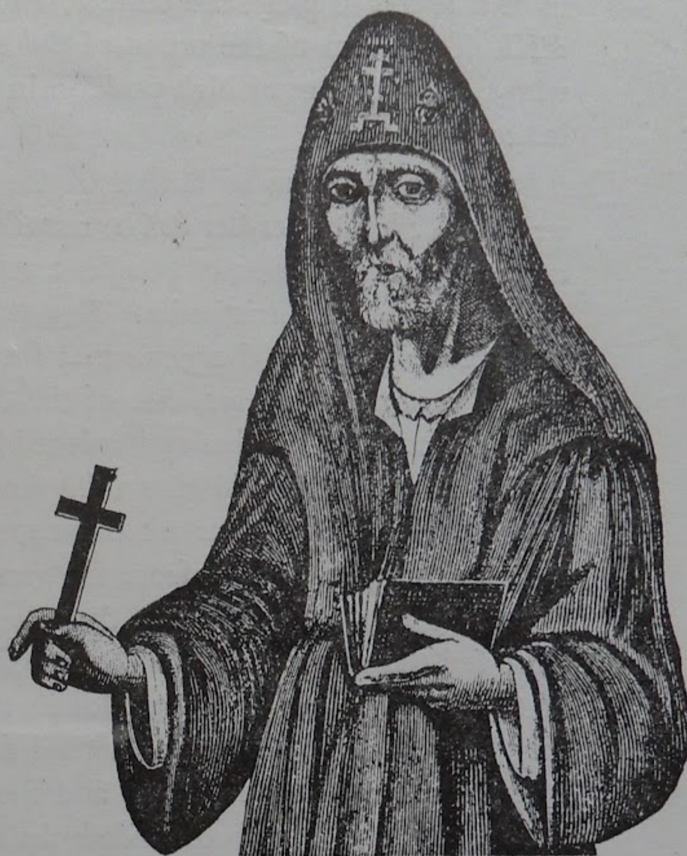
Blessed Theophilus of the Kiev Caves