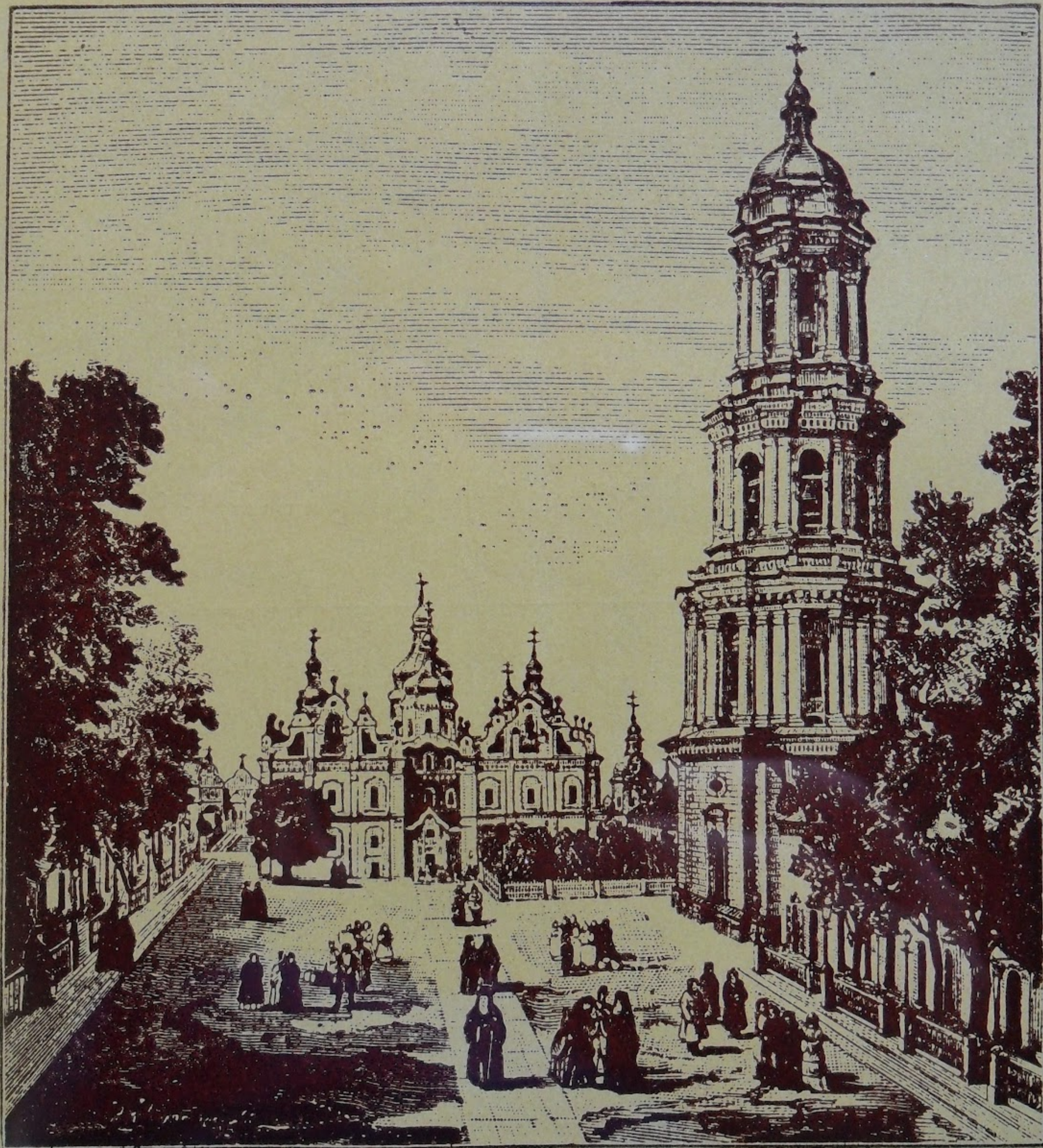
Kiev Caves Lavra