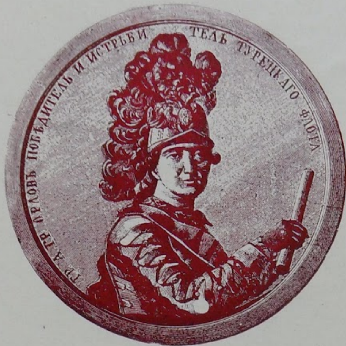
Count Alexis Orlov