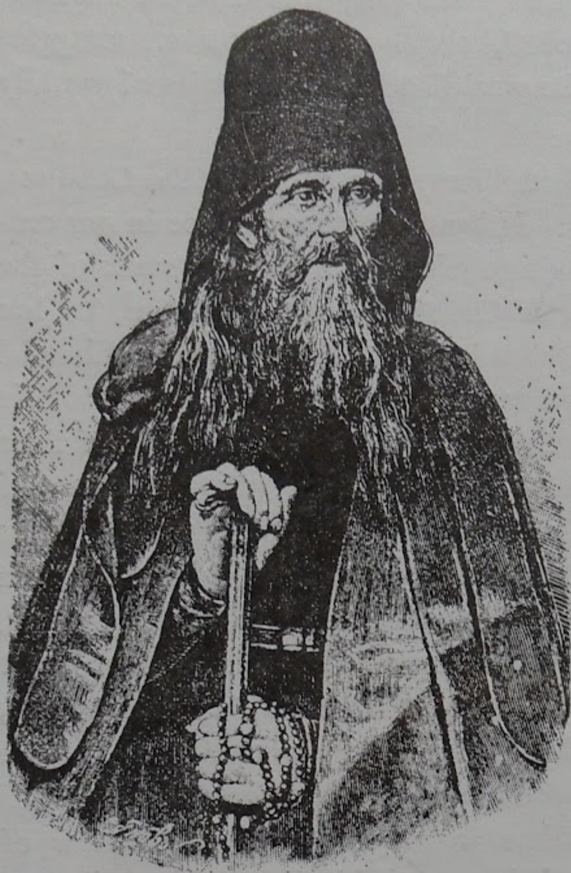
Elder Parthenius of the Kiev Caves Lavra